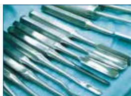
Medical and labor industries