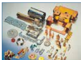
precision tools industry